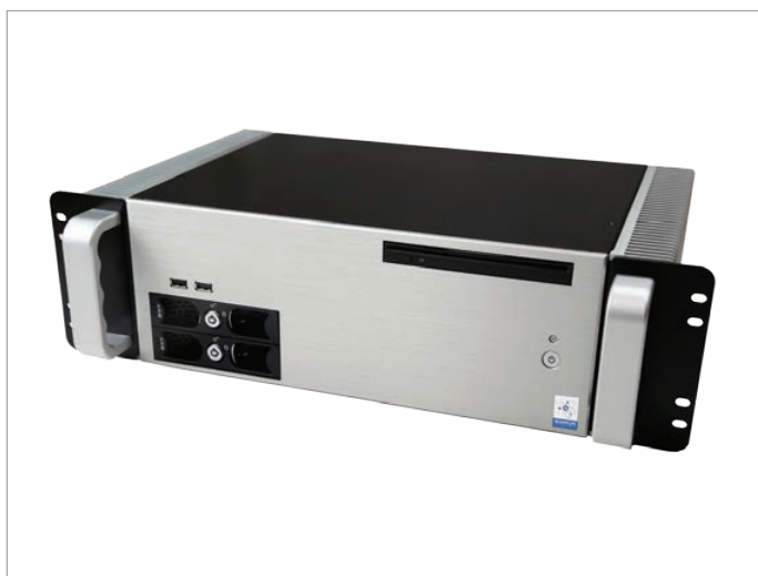
2 HDD/SSD bay 3.5" version